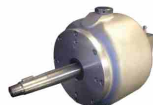
Triton 507 Out put—50cc Per rev. Material—Aluminium