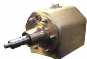
SB10 Helm Pump Output—164cc Per rev. Material—Bronze Military Grade