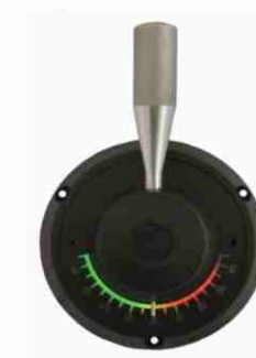
Full Follow Up Lever