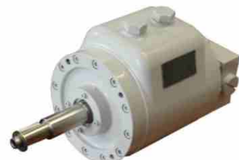
Neptune Series Output—Various from 77cc per rev up to 119cc per rev Material—Aluminium