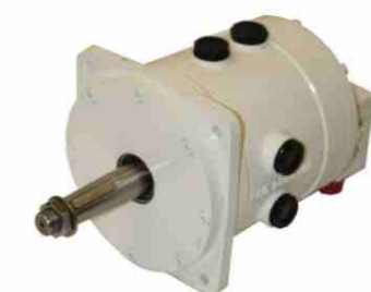
Tetra Series Output—Various from 18cc per rev up to 250cc per rev Material—Aluminium