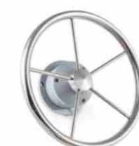
Non Follow Up Wheel