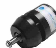
Full Follow Up Electric Helm Unit