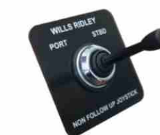
Non Follow Up Joystick