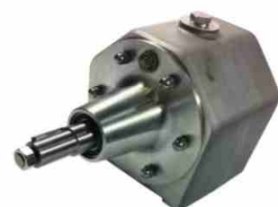
S10 Helm Pump Output—164cc Per rev. Material—Aluminium