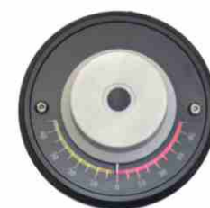
Full Follow Up Knob